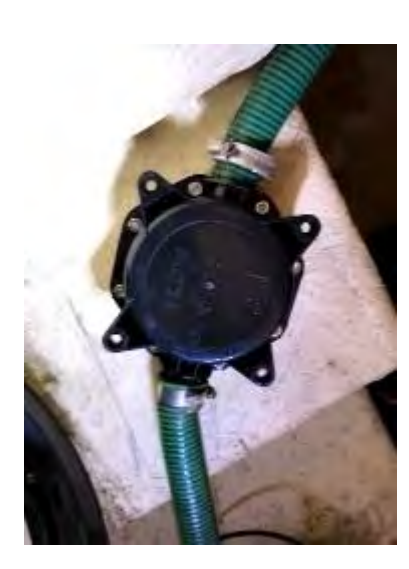
Fig 3 – New pump installed as seen inside cabin