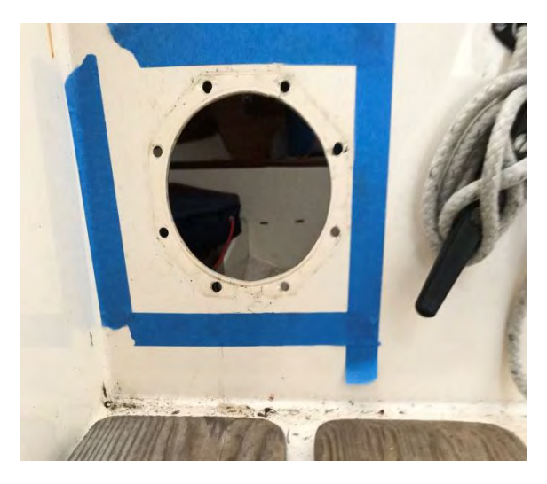
Fig 1 – pump mounting holes enlarged to suit new pump

I found the process quite difficult to begin with but, once I had come up with the idea of using the nails, I installed the replacement pump single handed, although, in retrospect, a crew would have been helpful! It was now time to reconnect the inlet and outlet hoses and to test the pump – success!! Figs 3 shows the newly installed pump from inside the cabin with all hoses connected and Fig 4 the pump in position in the cockpit.