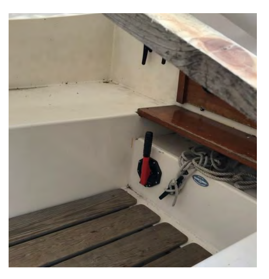
Fig 4 – New pump installed seen from the cockpit